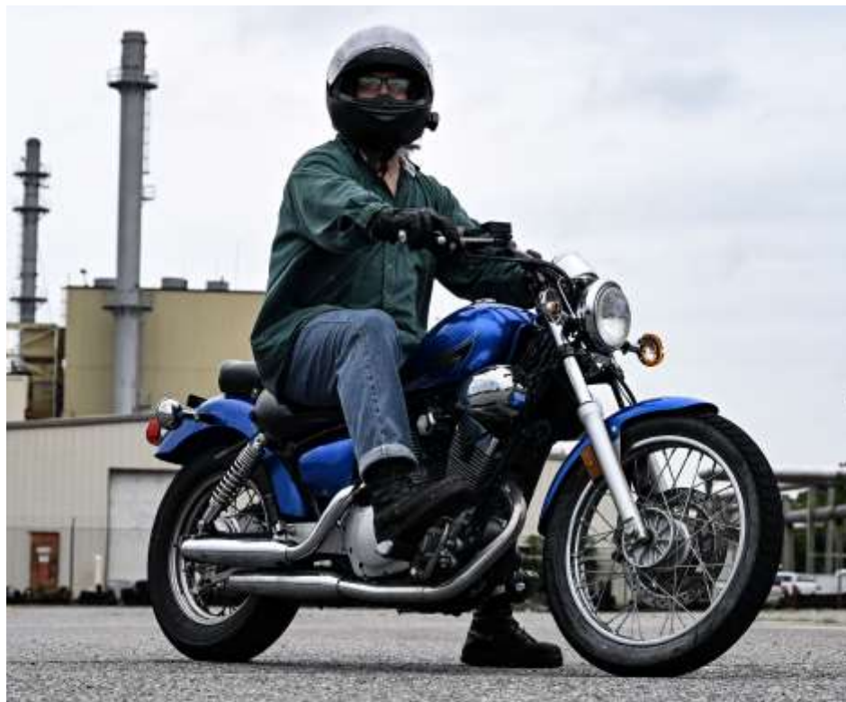
A Sailor practices safe stopping procedures during a safety course hosted by the Mid-Atlantic region motorcycle training team and Naval Safety Command, aboard Naval Station Norfolk, July 25.

Amidst the critical mission of ensuring operational readiness, the diligent efforts of MSRs, supervisors and collateral duty safety officers persist in keeping personnel current with their training and licensing. The Rider Down reports are indispensable tools in our arsenal, integral to safety and training briefs. Their detailed insights and analysis are